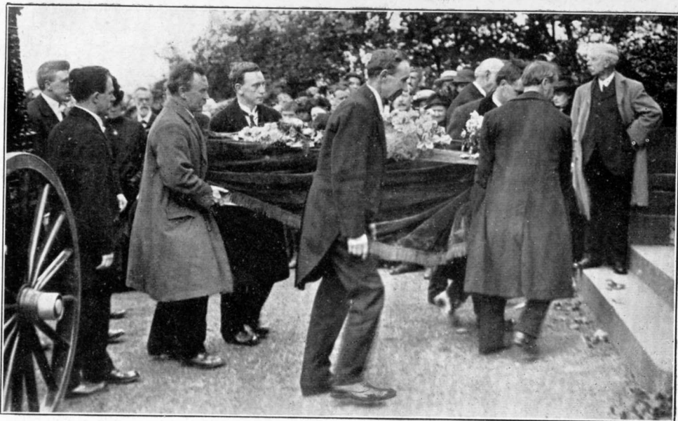
The coffin containing the body of J. Keir Hardie being carried by relatives into the Chapel at Maryhill Crematorium, Glasgow.